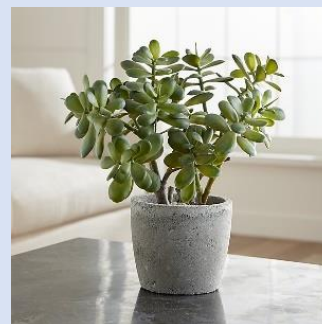
4. Jade Plant