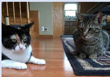
2. Pebbles & Mervin