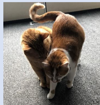
9. Butterfly & Rosie