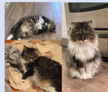
5. Coriander, Pie, Saffron